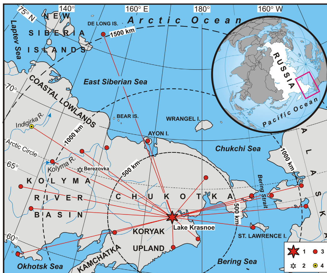
Fig. 1. Archaeological sites in Northeast Siberia and Alaska and obsidian sources in Northeast Siberia under consideration. 1 – the Lake Krasnoe obsidian source; 2 – possible obsidian source in the Berezovka River basin; 3 – the most remote archaeological sites in Northeast Siberia with obsidian from the Lake Krasnoe source; 4 – Boulumuna-Taasa site.

exchange and transportation in Northeast Siberia.