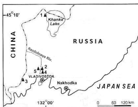
FIG. 1: Location of the Neogene deposits' outcrop groups in the southern part of Primorye: 1 – holostatotype of the Novokachalinskaya Formation (the Middle Miocene); 2 – hypostratotype of the Ust-Suifunskaya Formation (the Upper Miocene); 3 – hypostratotype of the Sineutesovskaya Formation (lower part of the Late Miocene); 4 – general outcrops of Shufansky horizon (the Pliocene); 5 – general outcrops of Nezhinskaya Formation (upper part of the Late Miocene)

The actual material for diatom analysis was based on long-term field studies of the Neogene strata of Primorye. More than 30 outcrops with paleobotanic and radiometric characteristics were studied (Pavlyutkin et al., 1993, 2004; Pavlyutkin and Petrenko, 2010). In the study of diatom complexes in Neogene sediments priority was given to stratotypes and supporting horizon outcrops and formations (Fig. 1).